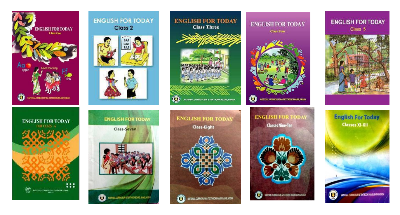
Figure: English for Today textbooks for different classes

English for Today is based on Communicative Language Teaching (CLT). So it promised to ensure learners' competence in all skills: speaking, reading, writing and listening. But as a contentcarrier and representative of CLT, English for Today has drastically failed to guarantee learners achieving all the four skills. In contrast, EFT has offered much challenge to the English teacher to implement it in the classroom. Chowdhury (2012) remarks, "It is very often seen that though the course book contains communicative activities for interactional activities in the classroom, the classes are rather non-communicative or teacher centered where the traditional 'teacher initiation-learner response-teacher follow up' interaction patterns happen (p. 25)."