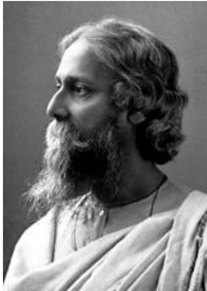
Rabindranath Tagore (1861-1941)

Courtesy: https://www.nobelprize.org/nobel_prizes/literature/laureates/1913/tagore-bio.html