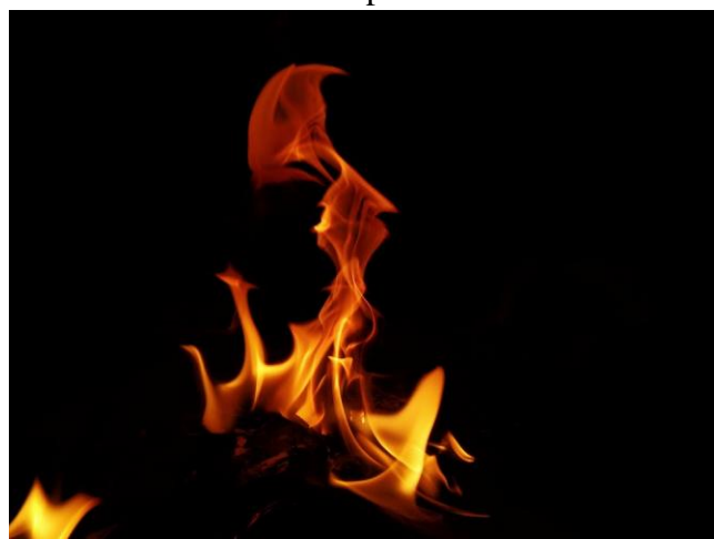
Fig 2: An image of fire.