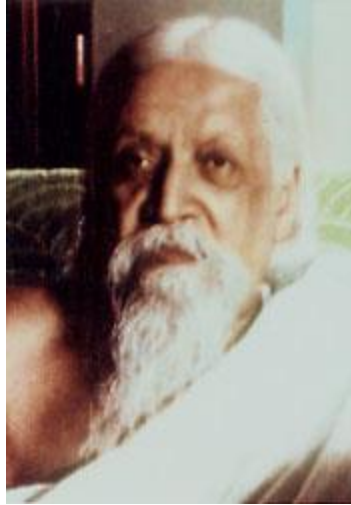
Sri Aurobindo (1872-1950)