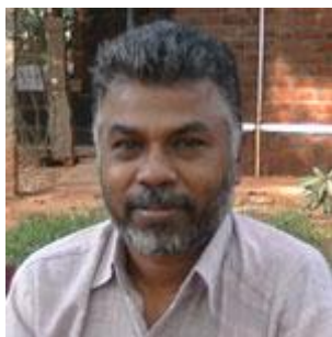
Perumal Murugan, author of Seasons of the Palm