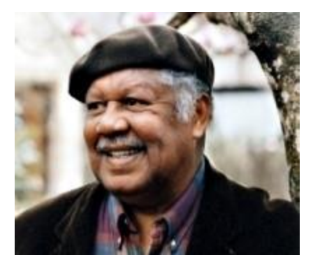
Ernest J. Gaines

A Lesson before Dying is an apt novel of Gaines that portrays the Jim Crow generation as a people toiling in their land as well as for their rights. The Black community is portrayed as learned and empowered by the whites, but the real liberation is yet to be found by the Blacks. The Blacks are educated but they are not accorded equality. The present generation had to struggle with the whites, poor life style, agonized past, and disillusioned youth community. They try to find solace in the religion they adopted. The religiosity of the Black community is subtly ridiculed by the author who feels that the education of the mind is more indispensable than the practices of the church.