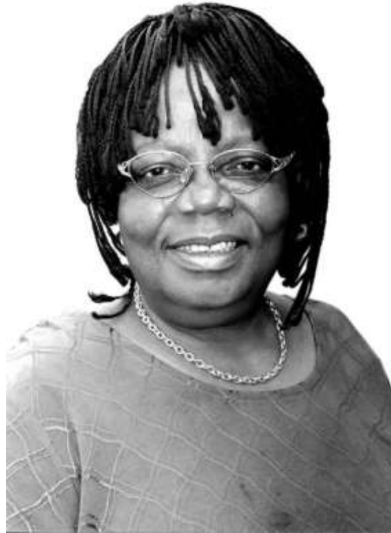
Buchi Emecheta 1944-2017

Abbreviation: TJOM- The Joys of Motherhood