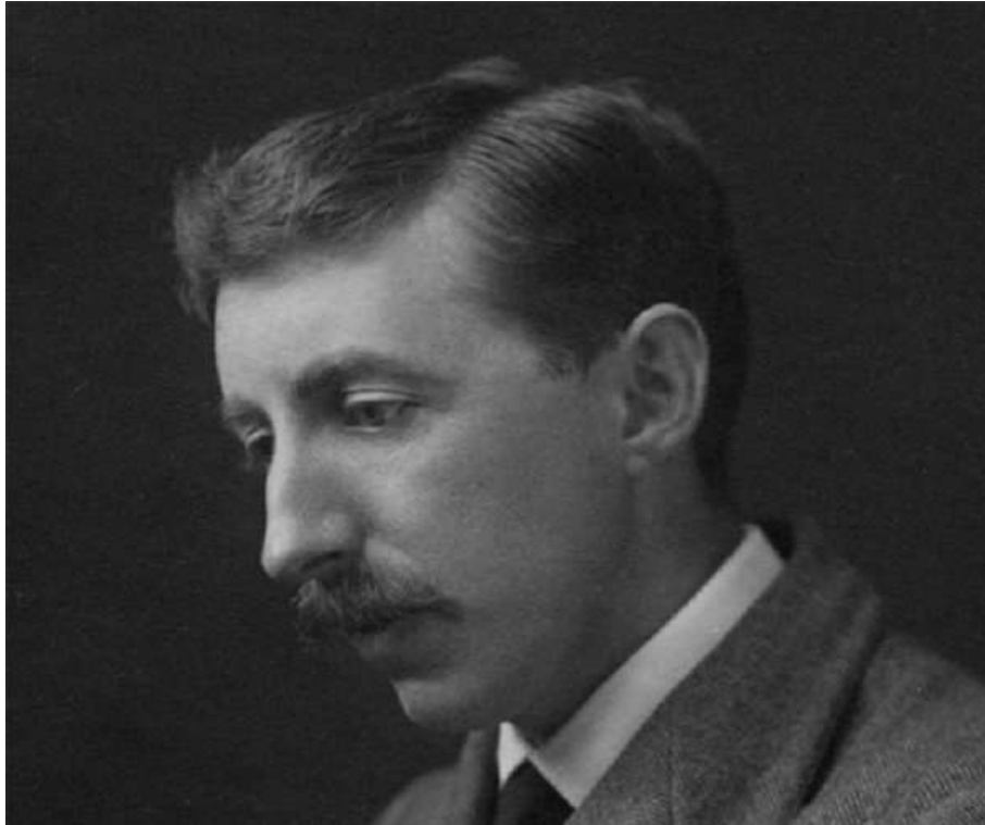
E. M. Forster (1879-1970)

Courtesy: https://www.thefamouspeople.com/profiles/edward-morgan-forster-1275.php