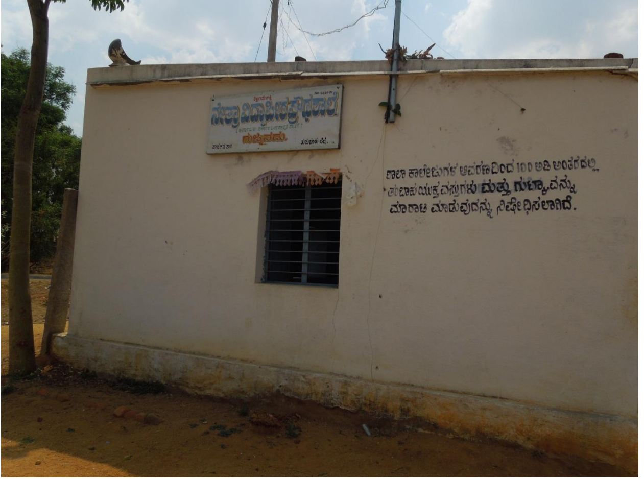
Fig. 3 - Netra Vidya Peeta High School, Gujjanadu