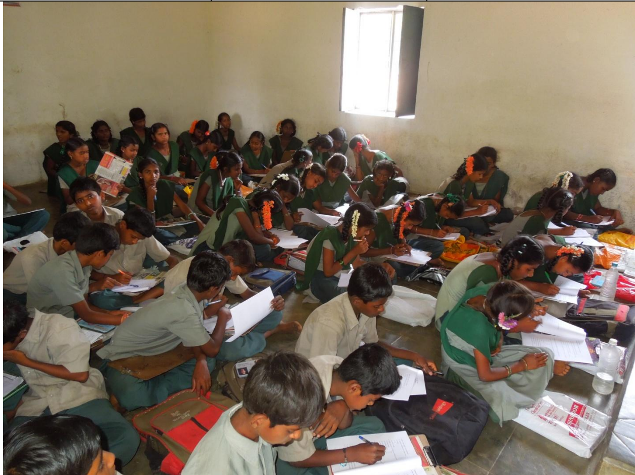
Fig.3 - Netra Vidya Peeta High School, Gujjanadu