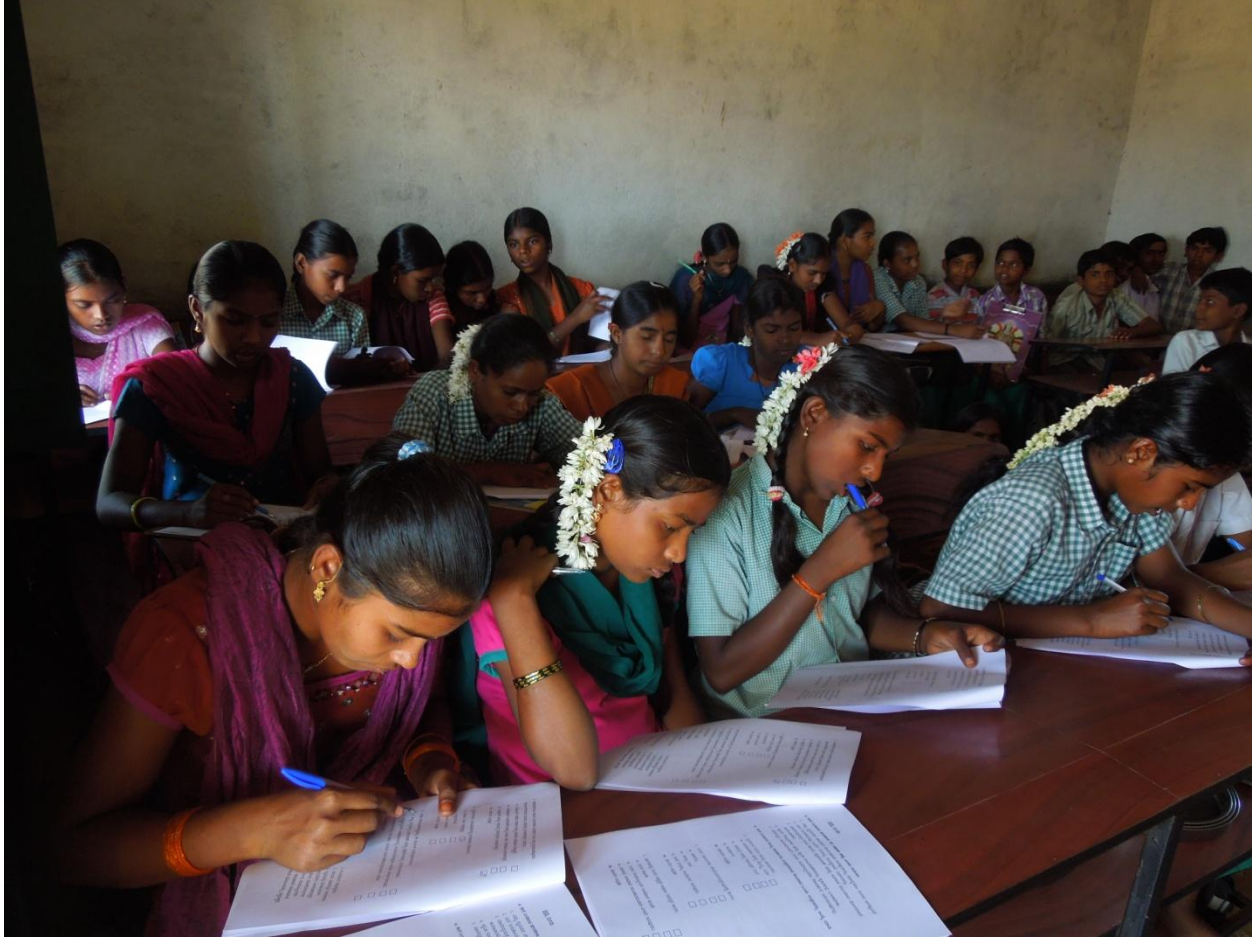
Fig. 2 - Sri Siddeshwara Swamy High School, C.K. Pura