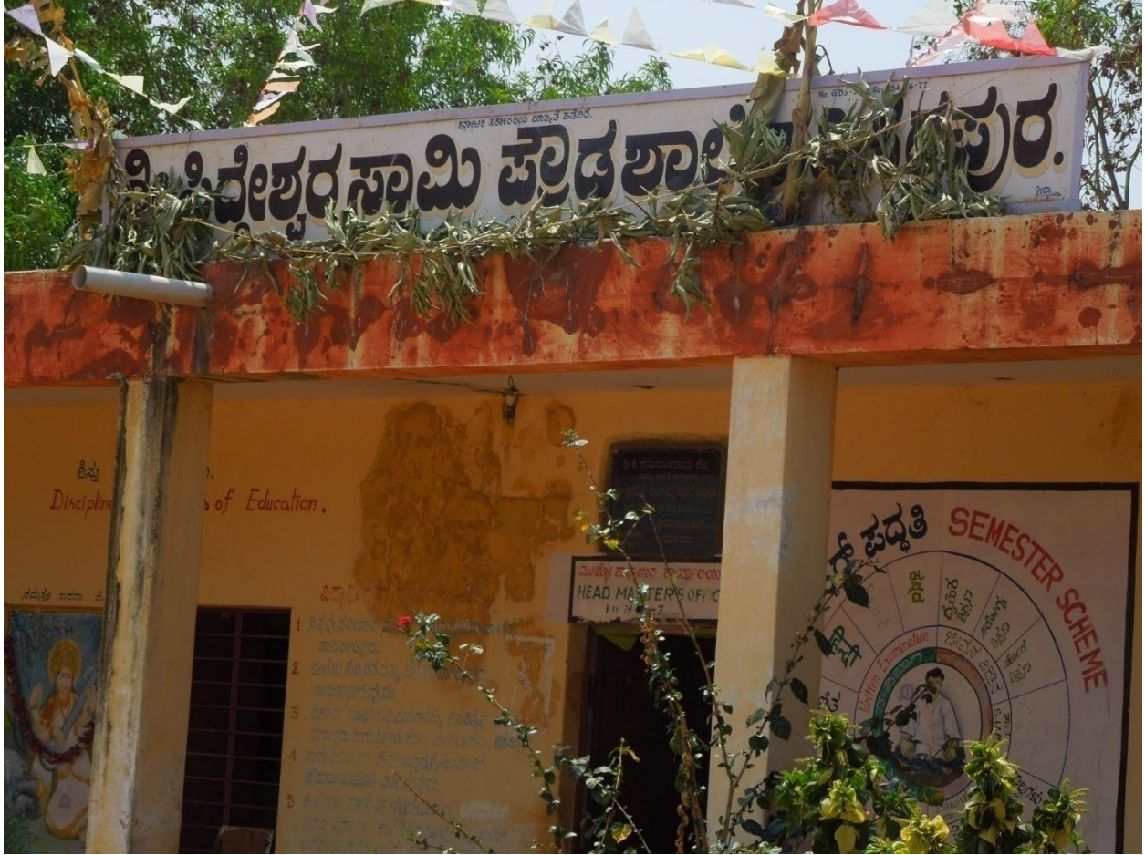
Fig. 2 - Sri Siddeshwara Swamy High School, C.K. Pura