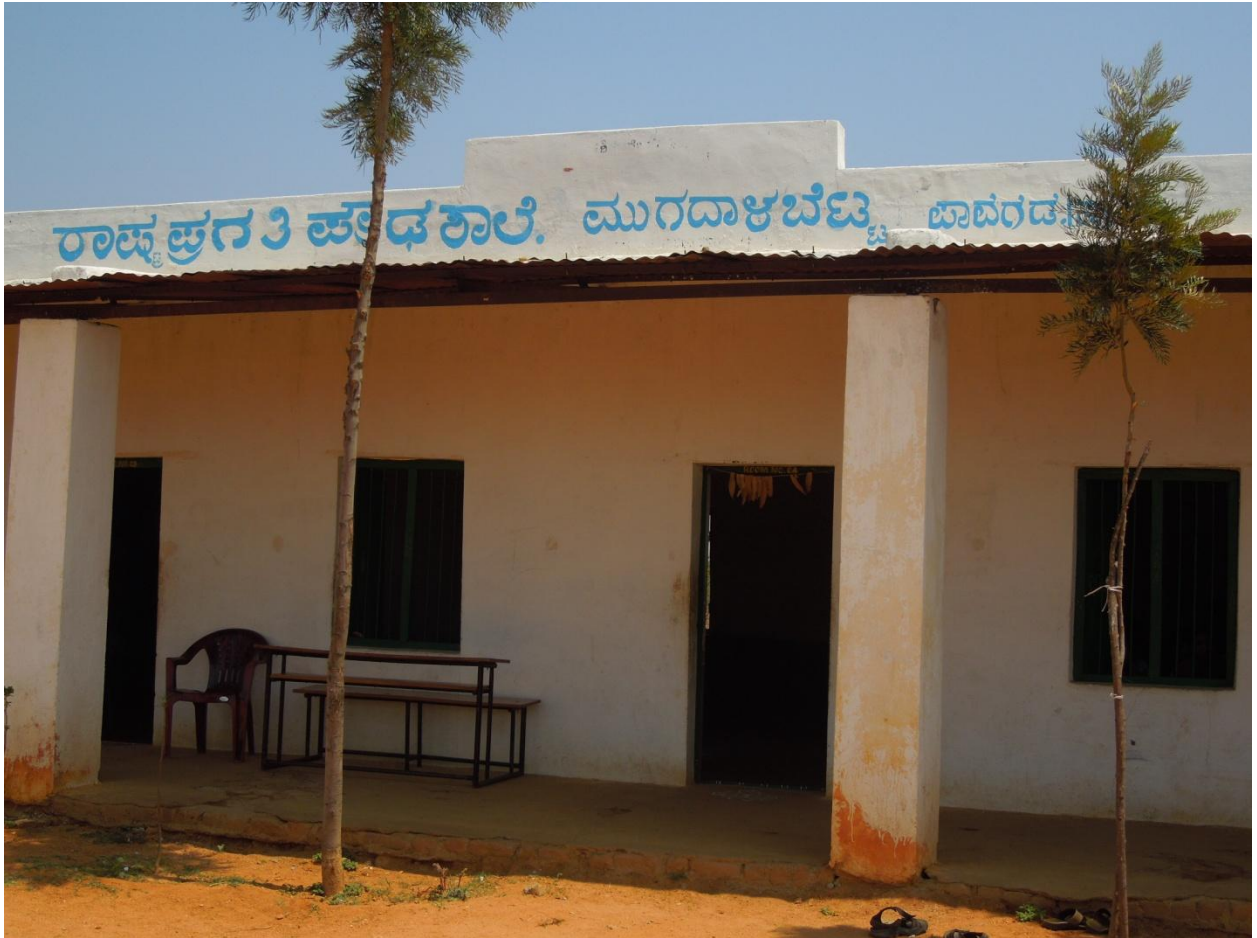
Fig. 1 - Rastra Pragathi High School, Mugdalabetta