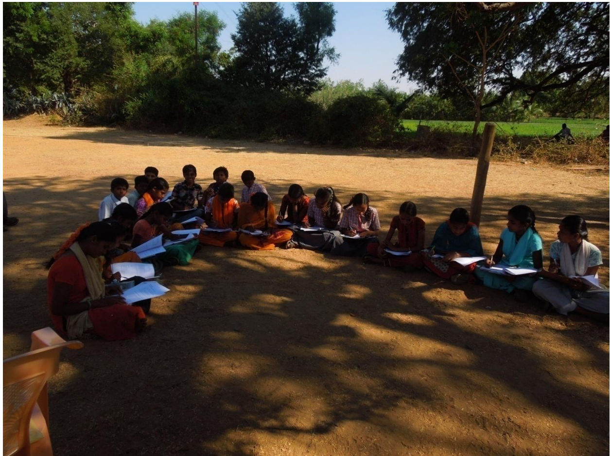
Fig. 1 - Sri Rama Rural High School, K.T. Halli

A pilot study was conducted on hundred 9 th standard High school students, selected randomly, 20 each from the 5 schools “Fig.1,2,3”. The results of this pilot study have been statistically analyzed and presented in the following pages.