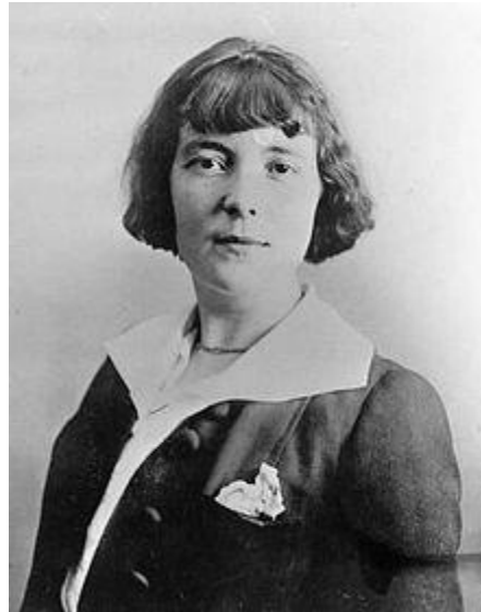
Katherine Mansfield 1888-1923

Key Words: Mansfield, The Doll's House , Human being, Innocence, Class consciousness, Social status