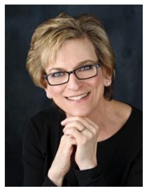
Anita Diamant