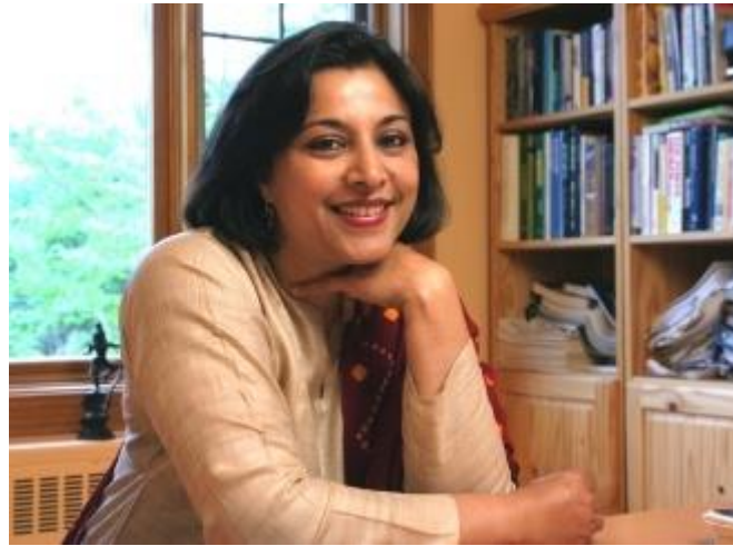
Anita Rau Badami

Courtesy: https://www.goodreads.com/author/show/83925.Anita_Rau_Badami