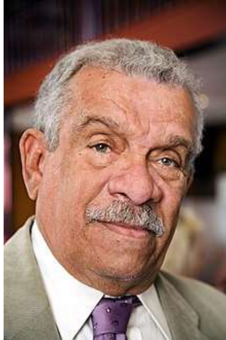
Derek Walcott (1930-2017)